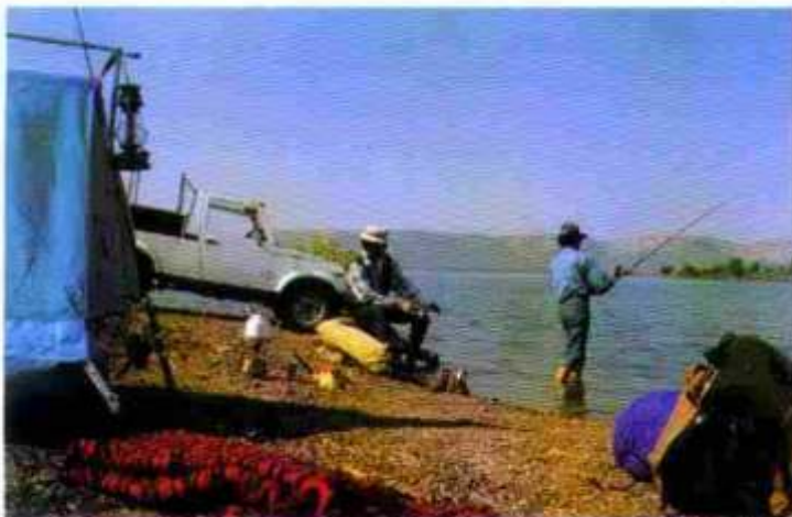
Soft top version

Motoring to new places can prove a delightful change. Pack