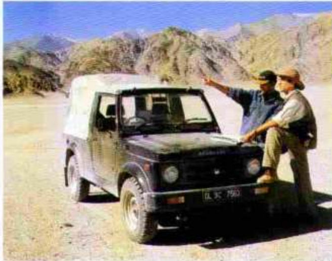
Soft top version

Within each of us lies the spirit of Freedom and adventure. A spirit that seeks to unshackle oneself from the grind and monotony of everyday living. To go off the beaten track of daily life to explore and discover the unknown.