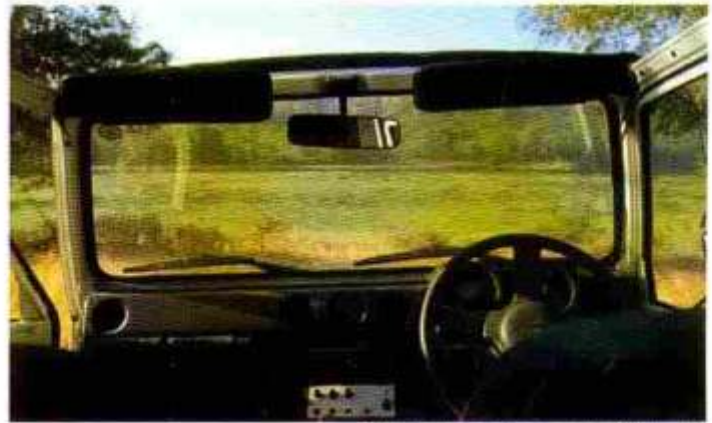
Optional accessories shown on soft top version

in your hair. Golf, photography, mountaineering, or just great hill Climbing.