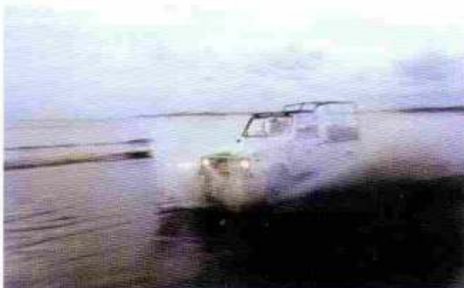
Soft top version

terrain or making your way through the urban jungle. With an incredible power of 80 bhp @ 6000 rpm. And a whopping torque of 103 Nm @4500 rpm.